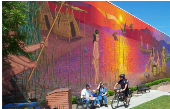
The Present Looks at the Past